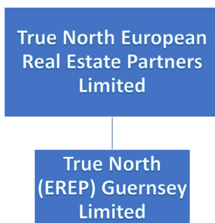
Figure 2: Organisational structure showing business units included and excluded

The entire True North Group is shown in the diagram.